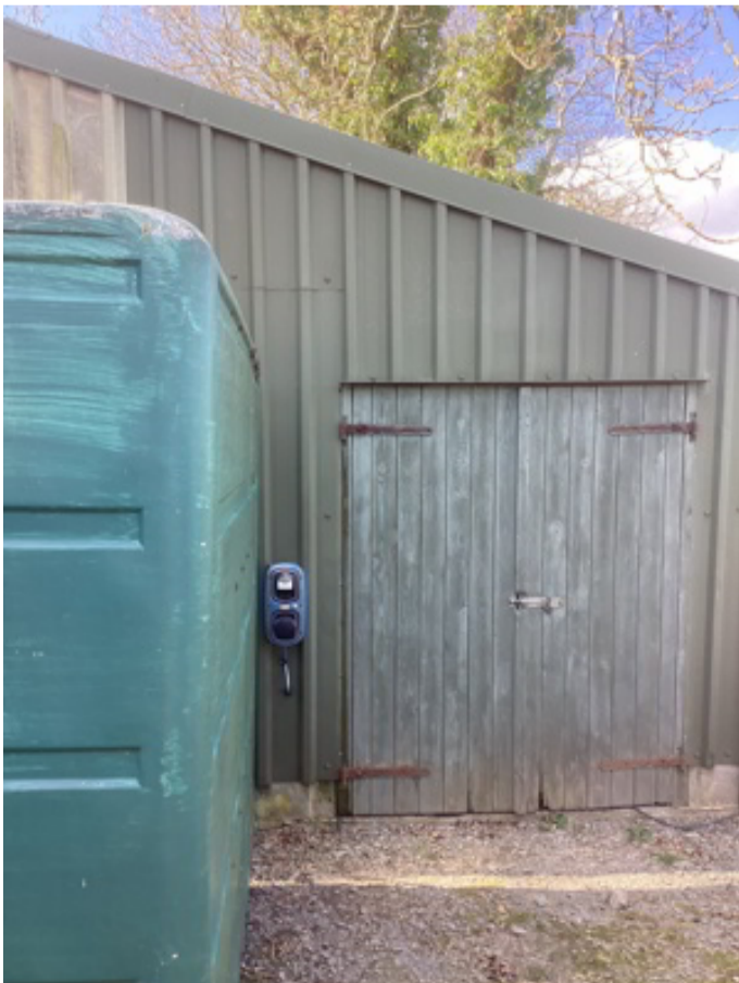
Hygge Hut EV Point

For Y Granar, the EV point is located in the lay-by next to the entrance gate to the walkway.